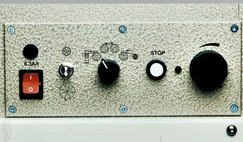
SPT 5000 K operating panel